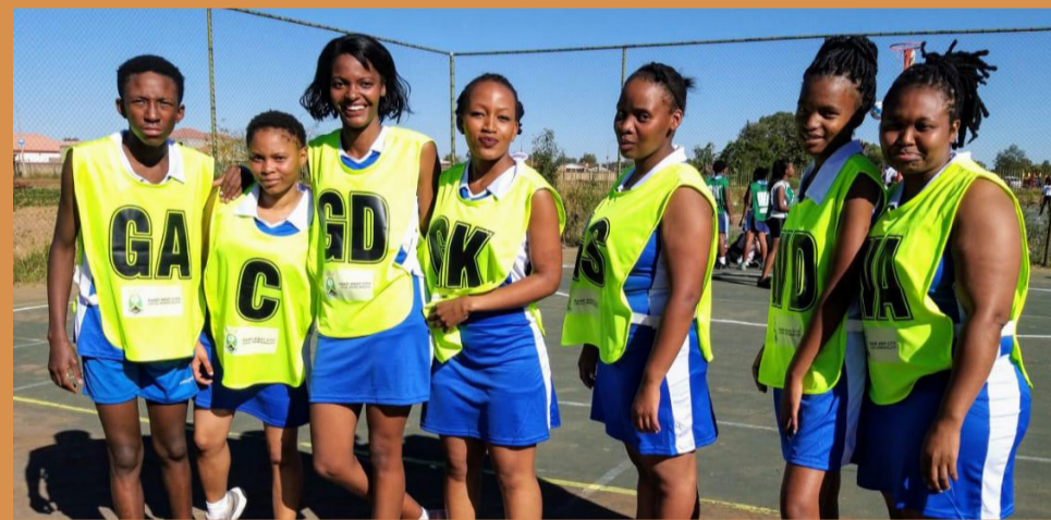
Netball ladies ready to begin the match

which was to curb crime, substance and alcohol abuse. This was done in a fun-filled environment, where both women and children felt safe, and children spent the day on multiple jumping castles, and enjoyed some sponsored party packs and lunch.