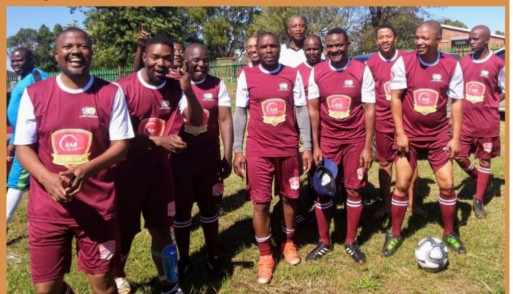
Prizes were given to winning teams . All prizes were sponsored for the event by SCM Development and Montrose Mega City Development