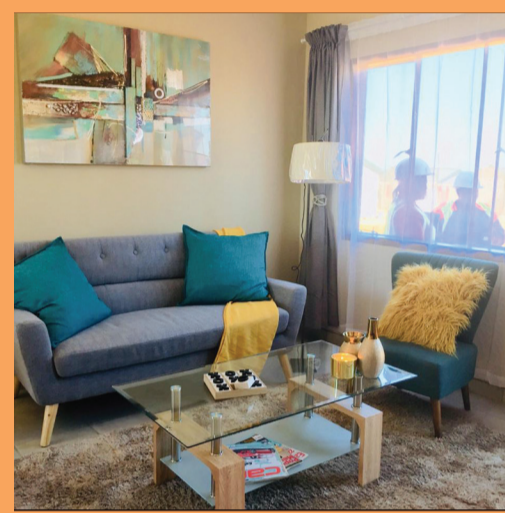
Montrose City Military Veteran 50 sqm home that was beautifully staged and on show for the Media Site Tour

Montrose City project board unveiling by the MEC for COGTA and Human Settlements, Mr Uhuru Moilola during the media site tour.