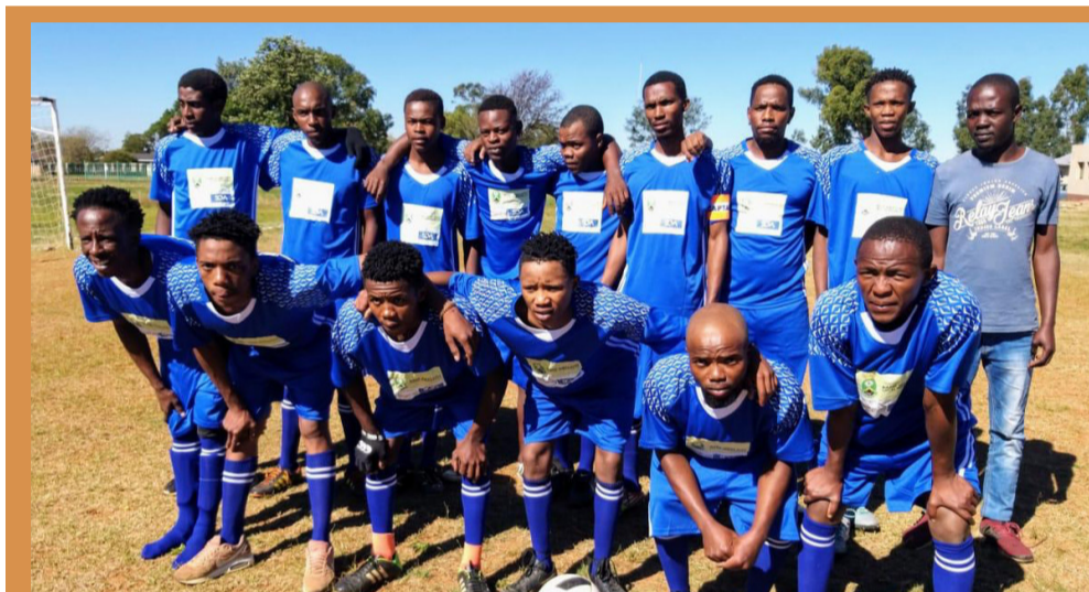
Soccer boys took their stand, ready to get the ball rolling

Not only did the event go incident free, but it placed emphasis on the objectives,